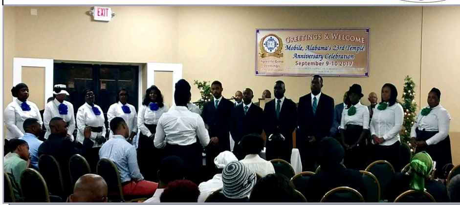
Mobile, AL choir rendering praise unto God during the 23rd Mobile Temple Anniversary

The 23rd Mobile Temple Anniversary was held recently, and the Mobile Temple Adult Choir was blessed to sing during the celebration. We now have a productive choir that is striving to improve its talent with the help of the Lord.