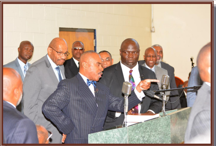
Pastor challenges the entire Church of God in Christ organization and their bishops

The topic discussed was, "Does The Holy Scriptures mention, teach, or support the Trinity."