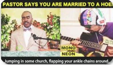
Various publicity publications