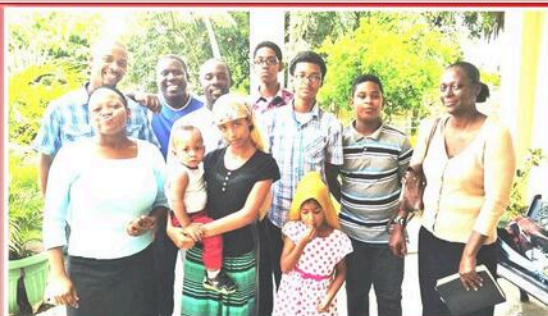
Saints in Trinidad