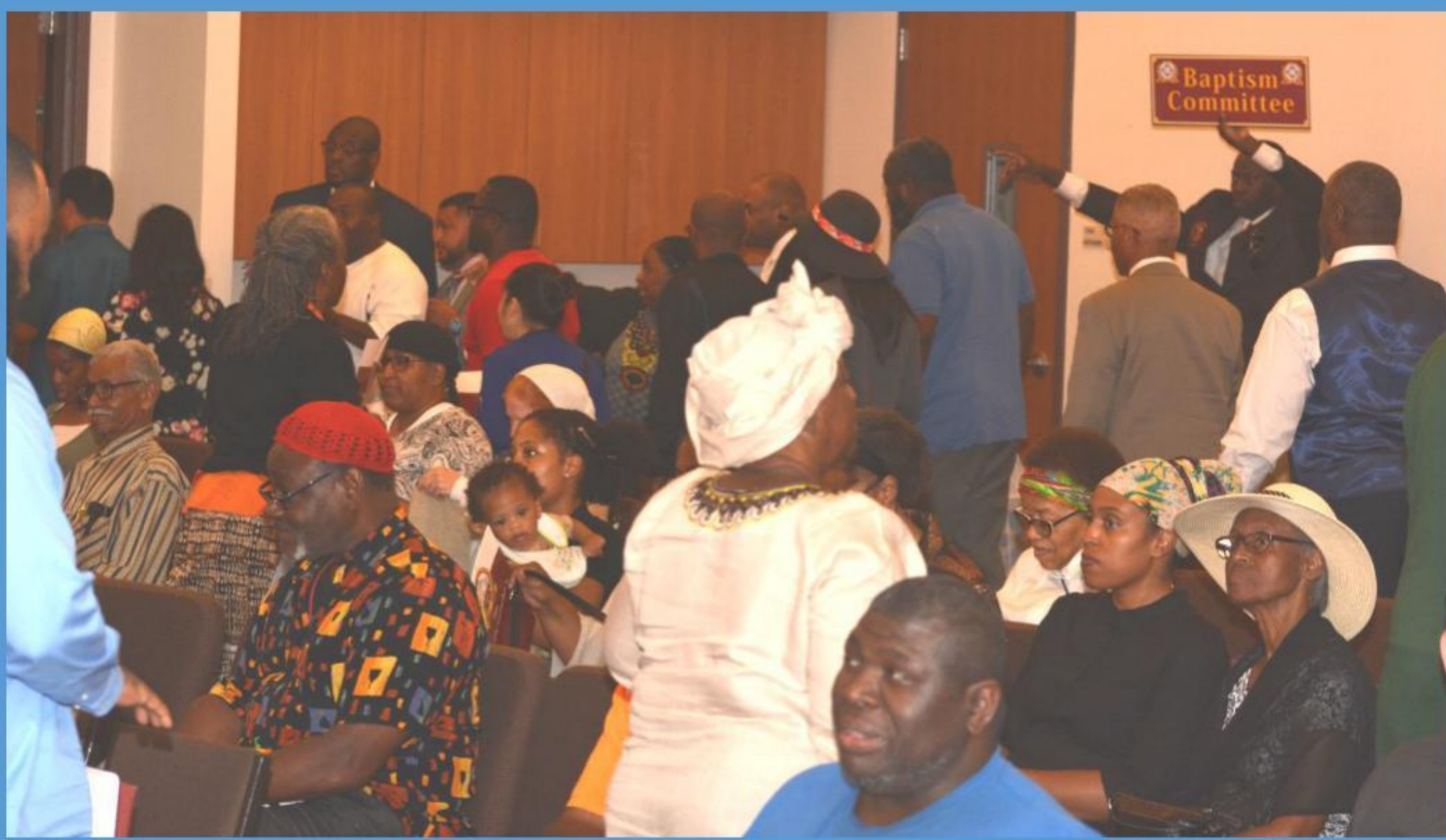
Baptism candidates exiting for baptism—Chicago, Illinois, USA

a protein in important in the prevention of have been heart disease. As well Gingko bi- community and loba (an herbal remedy from the colds and ginkgo biloba tree) has been used in the treatment of peripheral and cerebral vascular diseases (Elitok, 2014).