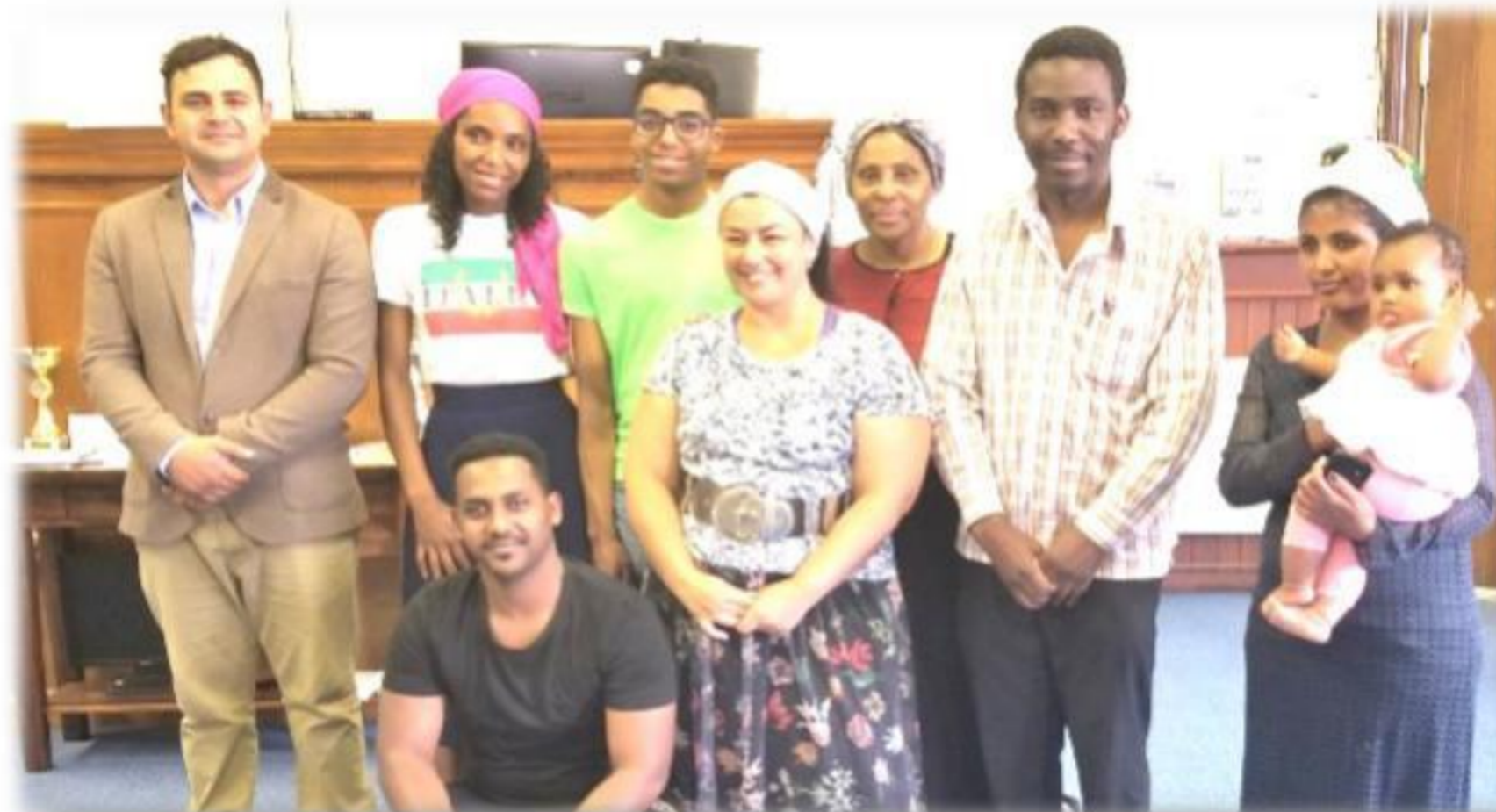
Baptism candidates—High Wycombe, England

The next stop was Harrisburg, PA where a total of thirty-four (34) were baptized. To