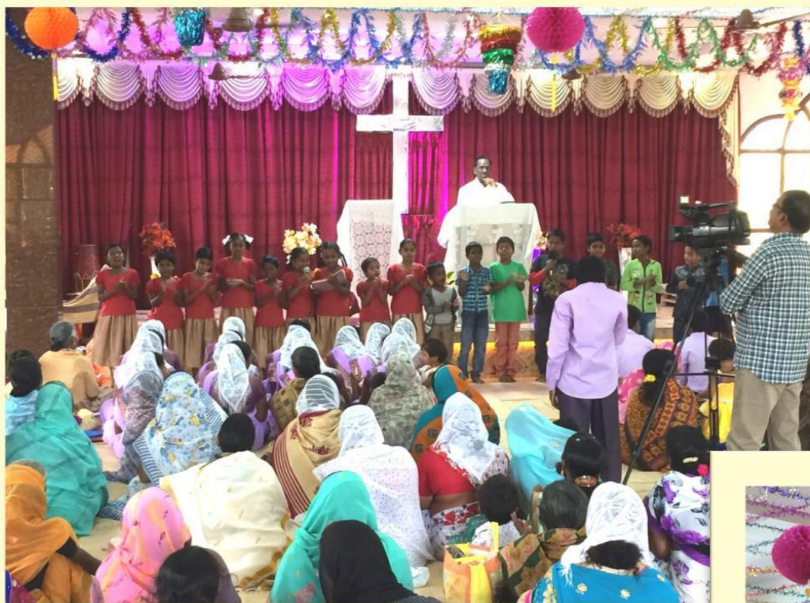
Saints of India receiving the words of Truth