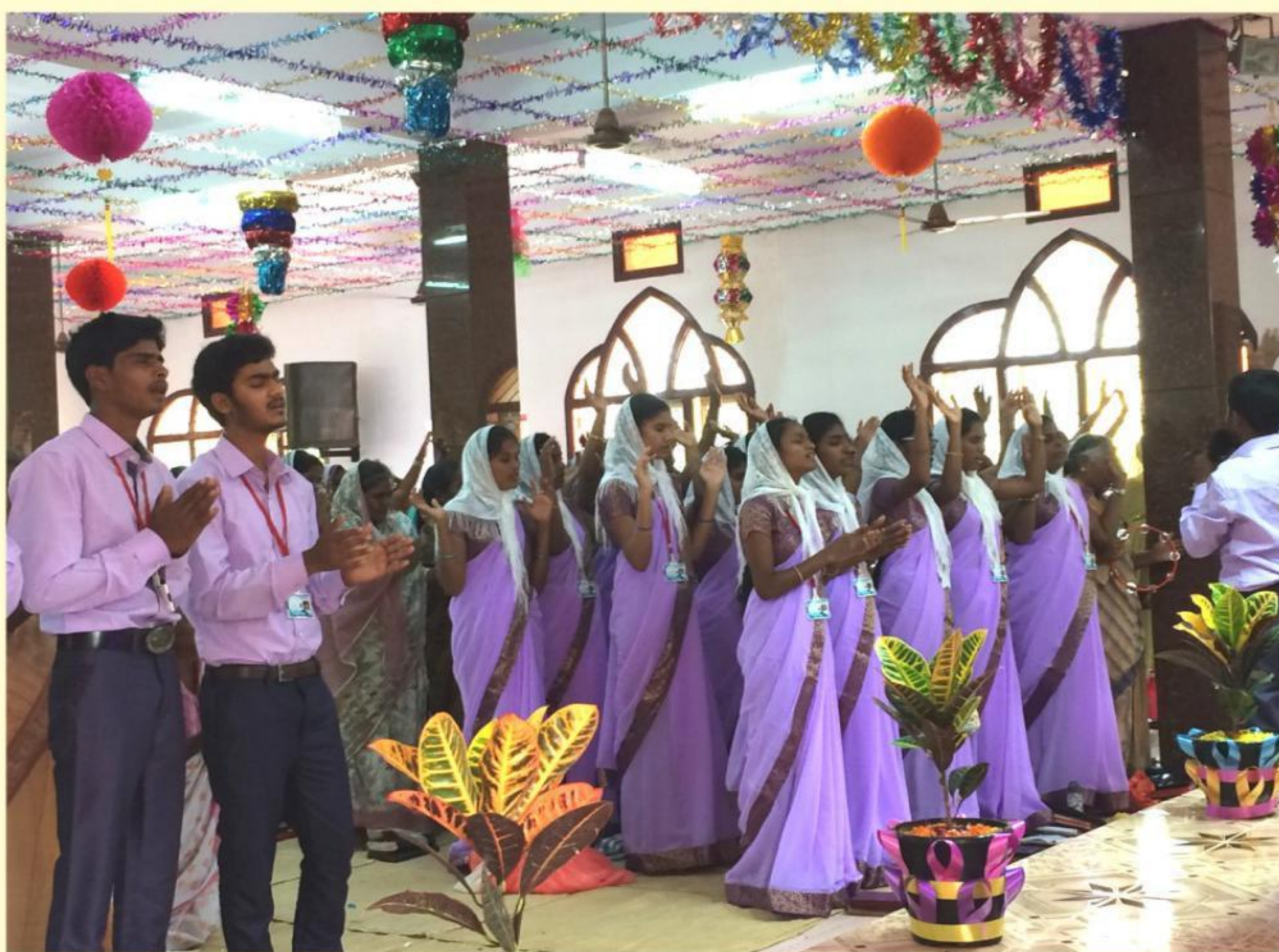
Saints of India singing praises unto The Lord

The saints introduced us to their families, opened their homes, cooked for us, and