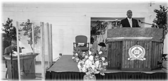
Livestream Service 1315- 1316