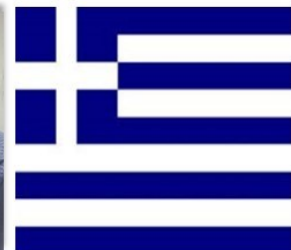
Petros Basoukos Athens, Greece